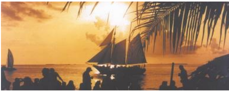
Topsail Schooner WOLF Flagship of the Conch Republic & Florida Keys 2012 Ambassador Voyage PROPOSED Schedule of Events (tentative – revised 12/29/11)